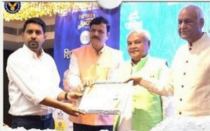
Best Steno Teacher Award