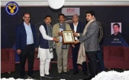
Best Steno Teacher Award