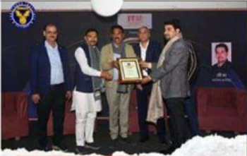
Best Steno Teacher Award