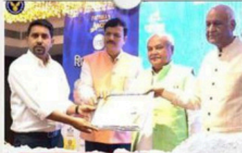
Best Steno Teacher Award