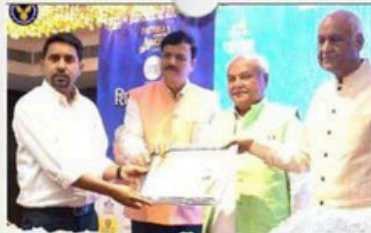
Best Steno Teacher Award