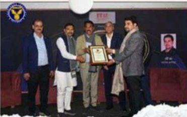
Best Steno Teacher Award