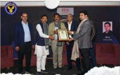
Best Steno Teacher Award