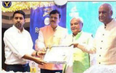
Best Steno Teacher Award