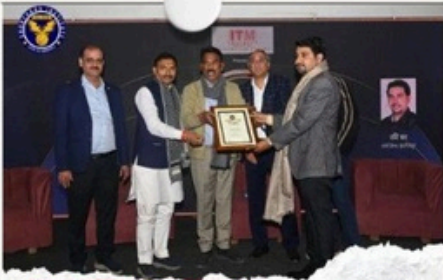
Best Steno Teacher Award