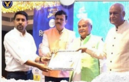
Best Steno Teacher Award