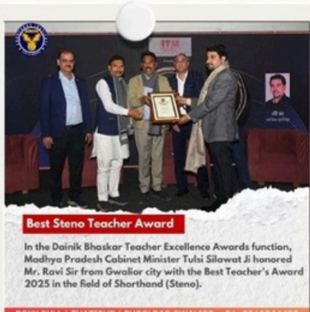
Best Steno Teacher Award