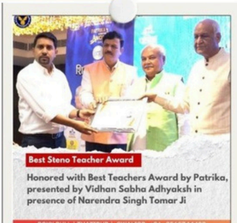
Best Steno Teacher Award